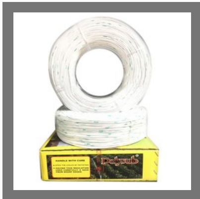
Polysub Insulated Submersible Winding Wire