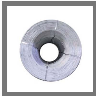
Poly Submersible Winding Wire